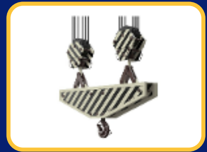
CRANE HOISTING SYSTEM