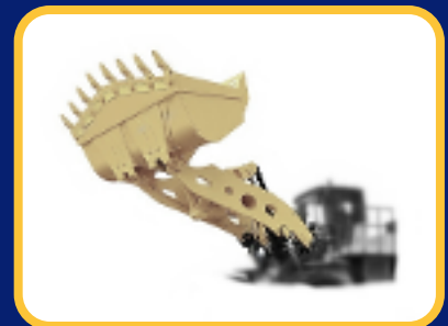
LOADER WORKING SYSTEM