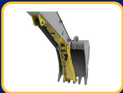
EXCAVATOR WORKING SYSTEM